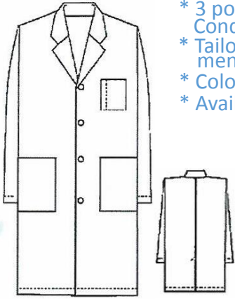
* Coat size chart (in cm)